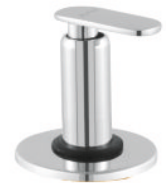
Concealed Stop Cock Upper Parts (Flange + Glassy + Handle ) For 15mm, 20mm & 15mm High Flow