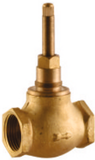
Concealed Flush Cock 1" - Medium / Heavy Body