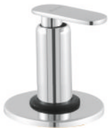
Concealed Flush Cock Upper Parts (Flange + Glassy + Handle ) For 25mm, 25mm / 40mm High Flow