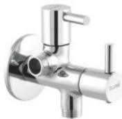
2 Way Angle Cock With Flange