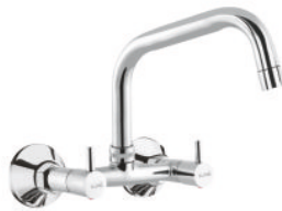
Wall Mounted Sink Mixer With Swinging Spout