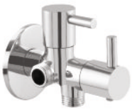
2 Way Angle Cock NE-06 | Rs. - 1015.00