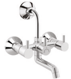
Wall Mixer Provision For Over Head Shower Arrangement (L-Bend Pipe) NE-14 | Rs. - 4025.00