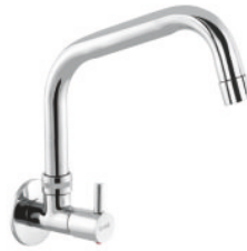
Sink Cock Swinging Spout With Flange