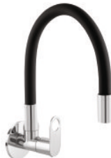
Flexible Sink Cock (Single Flow / Dual Flow) MO-07B | Rs. - 1885.00 MO-07C | Rs. - 1985.00