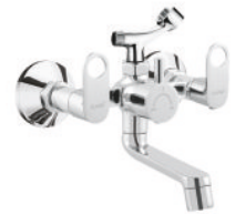
Wall Mixer Telephonic With Hand Shower Arrangement (Crutch) MO-13 | Rs. - 4240.00