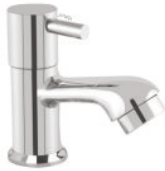
Pillar Cock NE-02 | Rs. - 730.00