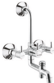
Wall Mixer 3 In 1 Provision For Both Telephonic & Over Head Shower