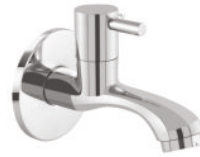
Bib Cock Long Body NE-04 | Rs. - 610.00