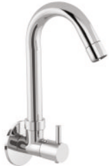
Sink Cock Swinging Spout NE-07 | Rs. - 1190.00