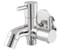
2 Way Bib Cock NE-05 | Rs. - 1175.00