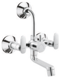
Wall Mixer Provision For Over Head Shower Arrangement (L-Bend Pipe)