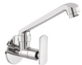
Sink Cock Casted Spout With Flange