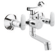
Wall Mixer Telephonic With Hand Shower Arrangement (Crutch)