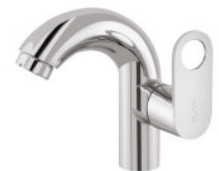
Pillar Cock MO-02A | Rs. - 1195.00

Note : No Warranty On Flexible Pipe in Single & Dual Flow Spout