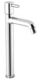
High Neck Pillar Cock Extension Body