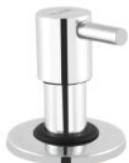
Concealed Flush Cock Upper Parts (Flange + Glassy + Handle ) For 25mm, 25mm / 40mm High Flow