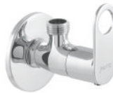
Angle Cock With Flange