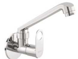
Sink Cock Casted Spout With Flange