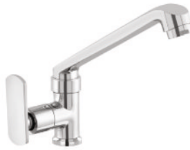
Swan Neck Pillar Cock With Casted Spout