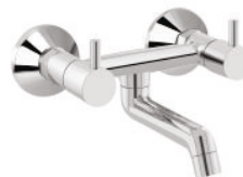
Wall Mixer Non-Telephonic