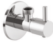
Angle Cock NE-03 | Rs. - 405.00