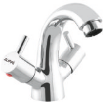
Center Hole Basin Mixer With Braided Hoses