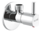
Angle Cock With Flange