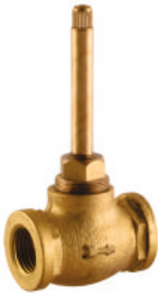
Concealed Stop Cock 1/2 - Medium / Heavy Body