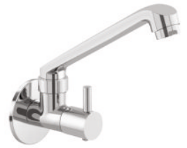
Sink Cock Casted Spout With Flange