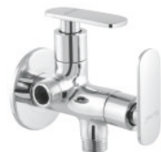
2 Way Angle Cock With Flange