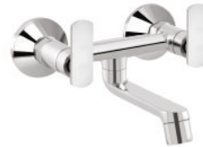
Wall Mixer Non-Telephonic