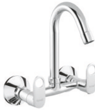
Wall Mounted Sink Mixer With Swinging Spout MO-12 | Rs. - 3050.00