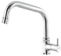
Swan Neck Pillar Cock With Swinging Spout