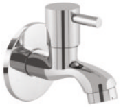
Bib Cock NE-01 | Rs. - 505.00