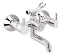
Wall Mixer Telephonic With Hand Shower Arrangement (Crutch) NE-13 | Rs. - 4025.00