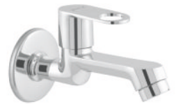
Bib Cock Long Body With Flange