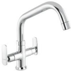
Center Hole Basin Mixer With Braided Hoses