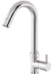
Swan Neck Pillar Cock With Swinging Spout NE-08 | Rs. - 1300.00