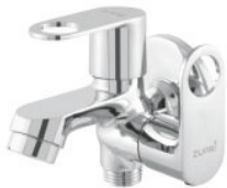
2 Way Bib Cock With Flange