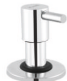
Concealed Stop Cock Upper Parts (Flange + Glassy + Handle ) For 15mm, 20mm & 15mm High Flow