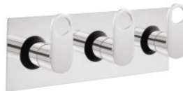
Concealed Wall Mixer Upper Parts (Flange + Glassy + Handle) MO-16 | Rs. - 2170.00