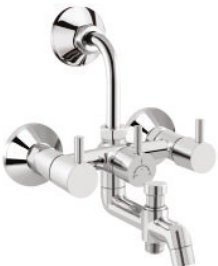
Wall Mixer 3 In 1 Provision For Both Telephonic & Over Head Shower NE-15 | Rs. - 4575.00