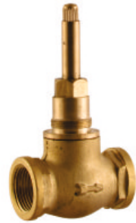
Concealed Stop Cock 3/4 - Medium / Heavy Body