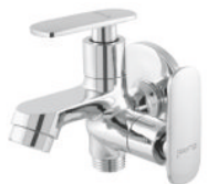
2 Way Bib Cock With Flange