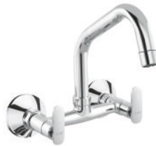
Wall Mounted Sink Mixer With Swinging Spout