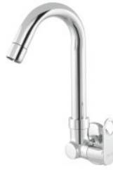
Side Handle Sink Cock Swinging Spout With Flange MO-09 | Rs. - 1490.00