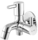
2 Way Bib Cock With Flange