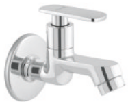
Bib Cock With Flange