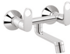
Wall Mixer Non-Telephonic MO-13A | Rs. - 3050.00