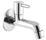
Bib Cock Long Body With Flange