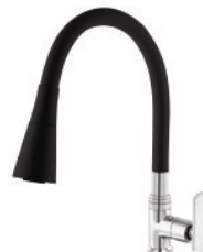
Flexible Swan Neck (Dual Flow / Single Flow)

LV-07B | Rs. - 1885.00 LV-07C | Rs. - 1985.00