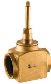
Concealed Flush Cock 1.1/2" - High Flow Body