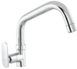
Swan Neck Pillar Cock With Swinging Spout