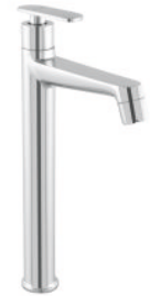
High Neck Pillar Cock Extension Body