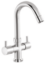
Center Hole Basin Mixer With Braided Hoses NE-11 | Rs. - 2535.00