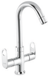
Center Hole Basin Mixer With Braided Hoses MO-11 | Rs. - 2795.00