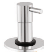
Concealed Flush Cock Upper Parts (Flange + Glassy + Handle) For 25mm & 25mm / 40mm High Flow NE-18 | Rs. - 390.00