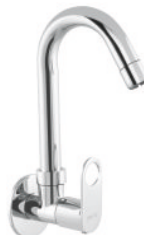
Sink Cock Swinging Spout With Flange