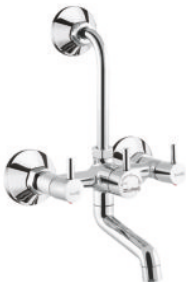
Wall Mixer Provision For Over Head Shower Arrangement (L-Bend Pipe)