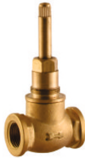
Concealed Stop Cock 1/2 x 3/4 Body