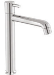
High Neck Pillar Cock Extension Body NE-10 | Rs. - 2465.00 H.N.P.C - 9" NE-10A | Rs. - 2065.00