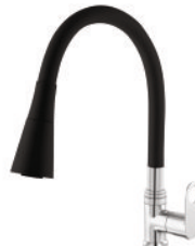
Flexible Swan Neck (Dual Flow / Single Flow) MO-08C | Rs. - 2075.00 MO-08B | Rs. - 1975.00