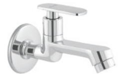
Bib Cock Long Body With Flange