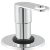
Concealed Flush Cock Upper Parts (Flange + Glassy + Handle) For 25mm, 25mm / 40mm High Flow MO-18 | Rs. - 475.00