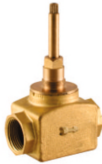
Concealed Flush Cock 1" - High Flow Body