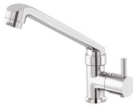
Swan Neck Pillar Cock With Casted Spout