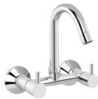
Wall Mounted Sink Mixer With Swinging Spout NE-12 | Rs. - 2870.00