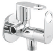
2 Way Angle Cock With Flange