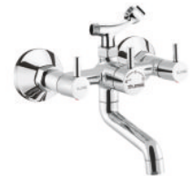
Wall Mixer Telephonic With Hand Shower Arrangement (Crutch)