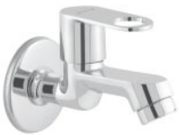
Bib Cock With Flange