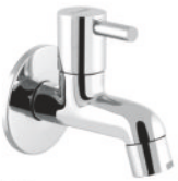
Bib Cock With Flange